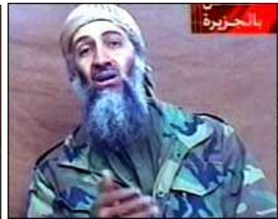
Dec 7, 2001 tape Very ill from Kidney Dialysis