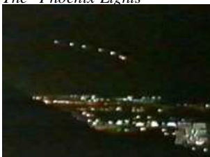
The "Phoenix Lights"

Six points regarding the Phoenix Lights from a press release of the National UFO Reporting Center, prepared by Peter B. Davenport: