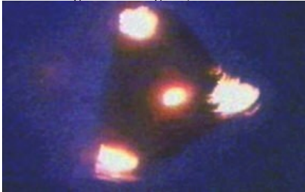
Black triangle over Belgium, 1989

Here is a good resource for the remarkable 1989-1990 triangle "flap" over Belgium, and here is an account of how it started: