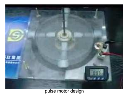
The next design can assist in their explaination of over unity devices which taps gravity.

Other devices produced by thier Research and development team include: