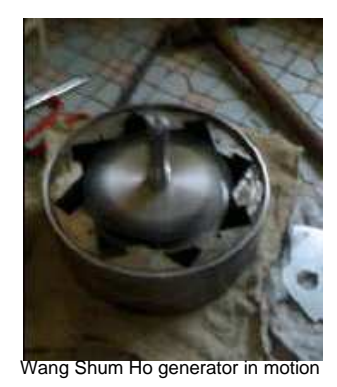
Energy from the air are seeking the marketing partner to promote this technology to the World. The Panacea research

The Panacea research and development center and the device can serve as a means to understand, develop, and test this unified model on all other developed over unity devices and ressurected reseach of suppressed energy technology.